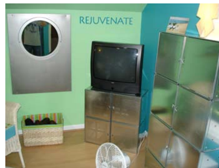
HGTV Suburban Craft Room Project (south wall)