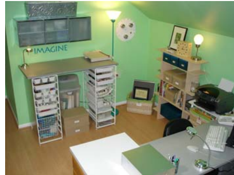
HGTV Suburban Craft Room Project (north wall)