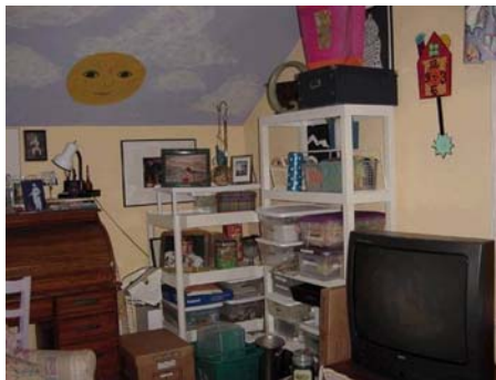
HGTV Suburban Craft Room Project (south wall)